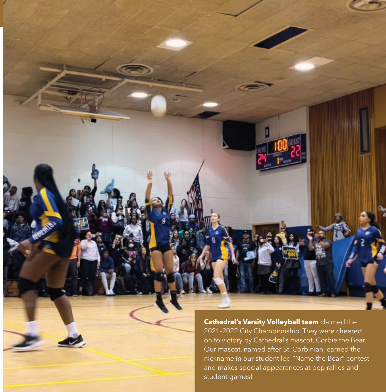
Cathedral's Varsity Volleyball team claimed the 2021-2022 City Championship. They were cheered on to victory by Cathedral's mascot, Corbie the Bear. Our mascot, named after St. Corbinian, earned the nickname in our student led "Name the Bear" contest and makes special appearances at pep rallies and student games!

Under the direction of talented and experienced coaches and directors, Cathedral athletes grow in skill, discipline, and endurance – and they have fun doing it! Students benefit from the use of our school gymnasium and workout equipment, as well as playing fields in Central Park and Roosevelt Island.